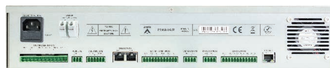
Rear View of PRIMA-VA/R